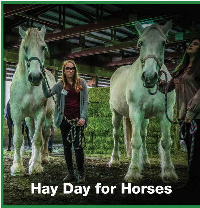
Hay Day for Horses

May 1st is the anniversary of the Equamore Foundation owning the Sanctuary property (5 years!). The first week in May is also the anniversary of Equamore itself (26 years!). The first Saturday in May is coincidentally the running of the Kentucky Derby. Hmm, what to do? These last three years we have joyfully celebrated our anniversaries on the first Saturday in May by taking the fun parts of the Kentucky Derby – big hats and mint juleps – to raise money for horses that have been discarded,